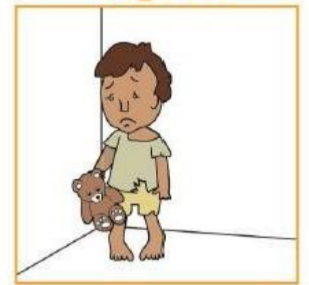
Carers Not Taking Care of You