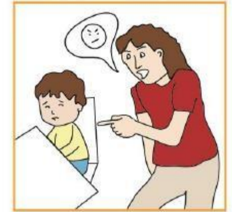
Harm to Your Heart or Mind