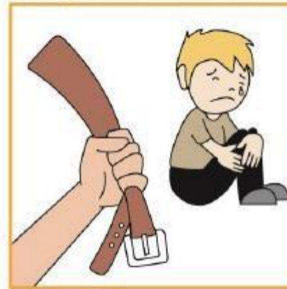
Harm to Your Body that Makes You Feel Pain